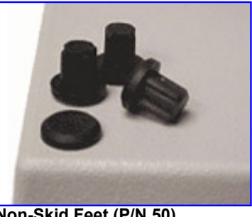
Non-Skid Feet (P/N 50) RETURN TO TOP